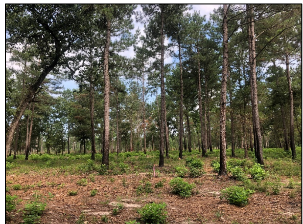
Loblolly pine stand burned following thinning, Montgomery County, 18 acres