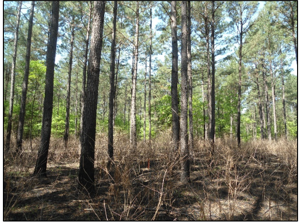
Mid-rotation loblolly pine plantation, Houston County, 800 acres