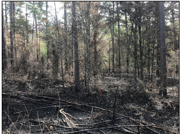
Mature longleaf pine stand, Nacogdoches County, 108 acres